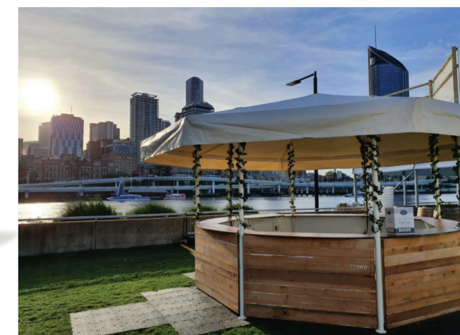
6 Sided Round Kiosk Quickset (#1)